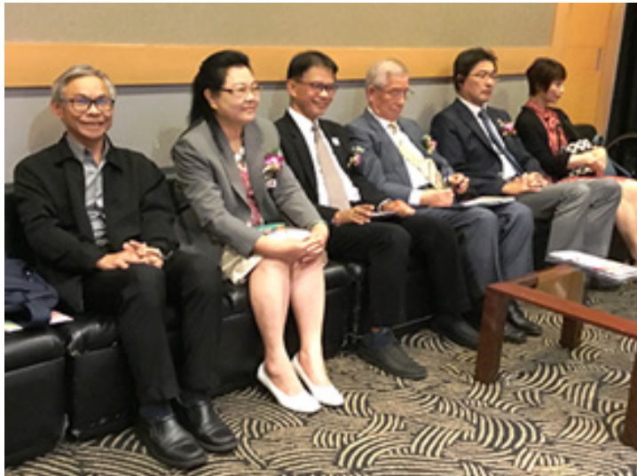
APCD attended the 20th Anniversary of the Wheelchairs and Friendship Center of Asia (Thailand), at Bangkok Art and Culture Center, 14 December 2019, Bangkok, Thailand