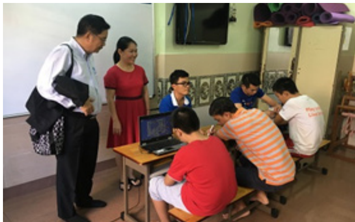
Visit to Partner Schools for Autism by the ASEAN Autism Mapping Project to understand the learning curve of children with autism, 16-20 February 2019, Ho Chi Minh City, Vietnam