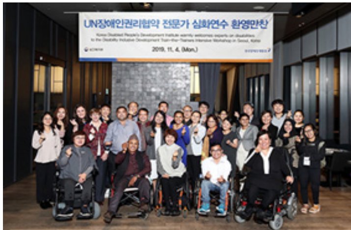
APCD attended the Disability Inclusive Development Train-the-Trainers Intensive Workshop that addressed CRPD as a significant framework for disability-inclusive development, 3-10 November 2019 in Seoul, South Korea