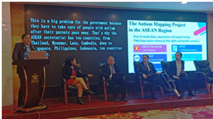
APCD attended the Regional Forum on Advancing Disability-Inclusive Development through the Beijing Action Plan, 18-19 December 2019 at Guangzhou City, China