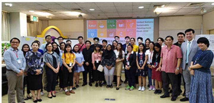
AICHR Youth Debate on Human Rights 2019 (Partnership for Sustainability) visit at APCD, 19 September 2019, Bangkok, Thailand