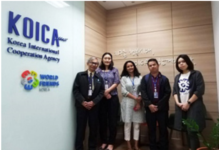
Exploratory Meeting for Future Collaboration with Korea International Cooperation Agency (KOICA), 28 January 2019, Bangkok, Thailand