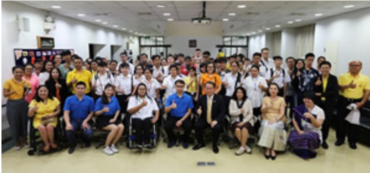
60+ Plus Projects for All Skills Development Training for Persons with Disabilities: Employability in Food Business 2019, Bangkok, Thailand, 18 July 2019