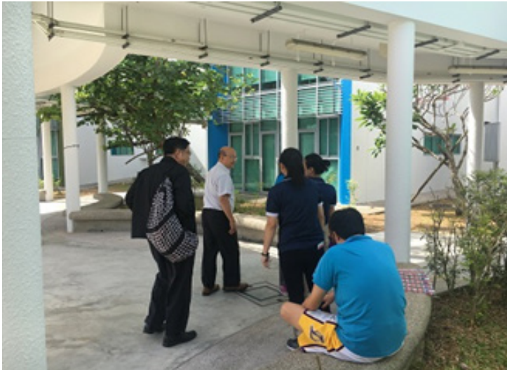
Visit and Meeting with Partners for the ASEAN Autism Mapping Project, 11-15 February 2019, Singapore