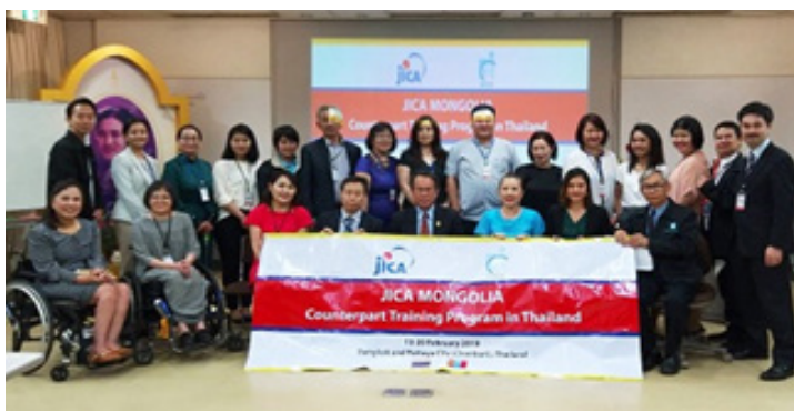
Japan International Cooperation Agency (JICA) Mongolia Counterpart Training Program in Thailand” Field Visit to APCD, 13-20 February 2019, Bangkok Thailand

12 participants representing JICA, the Government of Mongolia, disabled people’s organizations (DPOs), and non-government organizationstook part in a ‘Thai Study Tour 2019’ from 13 to 20 February 2019 in Bangkok and Pattaya, Thailand. The programme was organized by JICA/DPUB in collaboration with APCD. The study tour mainly focused on assessing the basic models used in the implementation of UN CRPD and inclusive best practices, to analyze the relationship among the agencies involved in the disability movement, the methods used, and the performance outcomes achieved by the populations served. The study tour wasalso a part of the Government of Mongolia’s promotion of 4th Asia-Pacific Community-based Inclusive Development Congress that was scheduled to take place on 2-3 July 2019 in Ulaanbaatar, Mongolia.