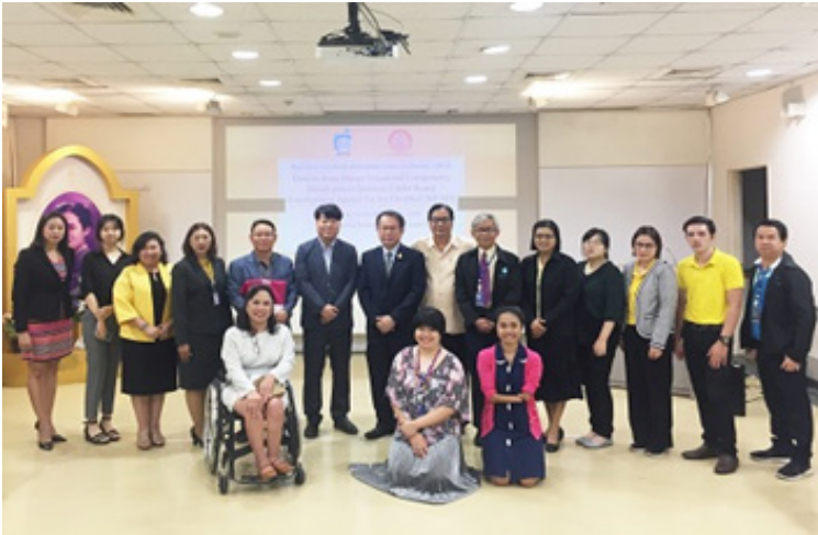
Study Visit of Daegu Vocational Competency Development Institute from South Korea, 31 July 2019, in Bangkok, Thailand