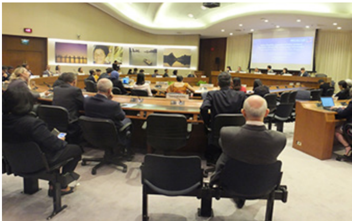
APCD Joined the Asia-Pacific Launch of the United Nations Disability Inclusion Strategy: Making the Right Real in Our Region, in commemoration of the International Day of Persons with Disabilities, 3 December 2019 in Bangkok, Thailand