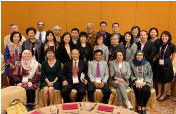
APCD participated in the Asia-Pacific Autism Conference, 20-22 June 2019, Singapore