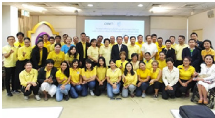
Designated Areas for Sustainable Tourism Administration (DASTA) Study Tour to observe and learn more about the concept of Universal Design in the hotel industry at APCD, 8 May 2019, Bangkok, Thailand