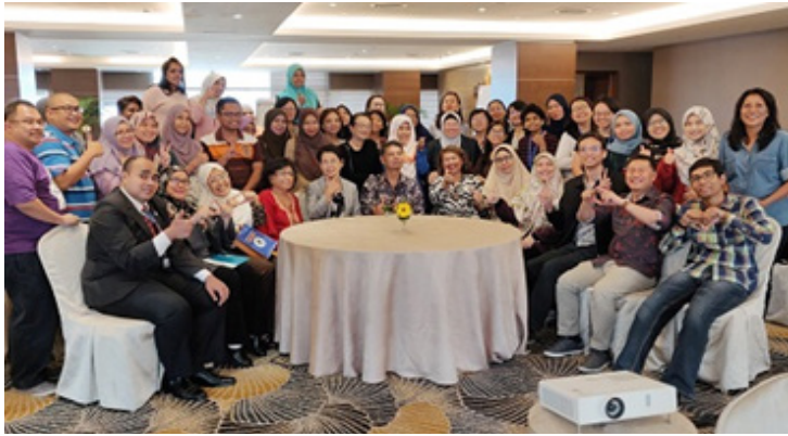
National Workshop for Policy Recommendations for APCD's ASEAN Autism Mapping Project, 26-28 April 2019, Kuala Lumpur, Malaysia