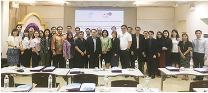
Delegates from Director-General Forum of ASEAN Countries on Development Cooperation pay a visit to APCD as field trip on 'Inclusive Society for ASEAN through Development Cooperation' on 23 August 2019