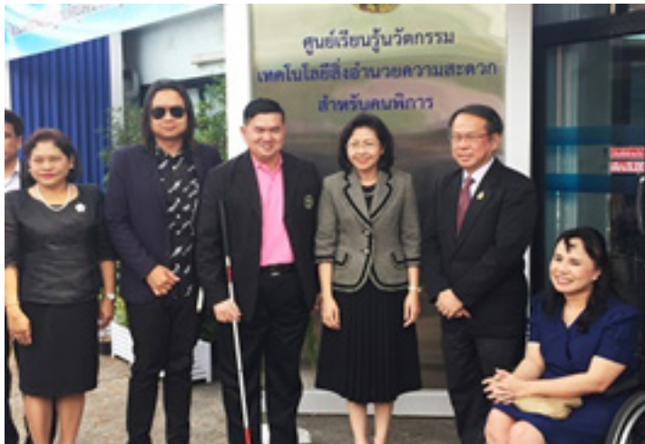
Courtesy Call to Department of Empowerment of Persons with Disabilities (DEP) and Support for 'Innovative for Blind' Event, 25 March 2019, Bangkok, Thailand