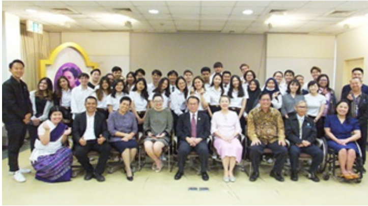
Bachelors and Masters level students from the Political Science Program in Politics and International Relations, Faculty of Political Science of Thammasat University visited APCD, 26 March 2019, Bangkok, Thailand