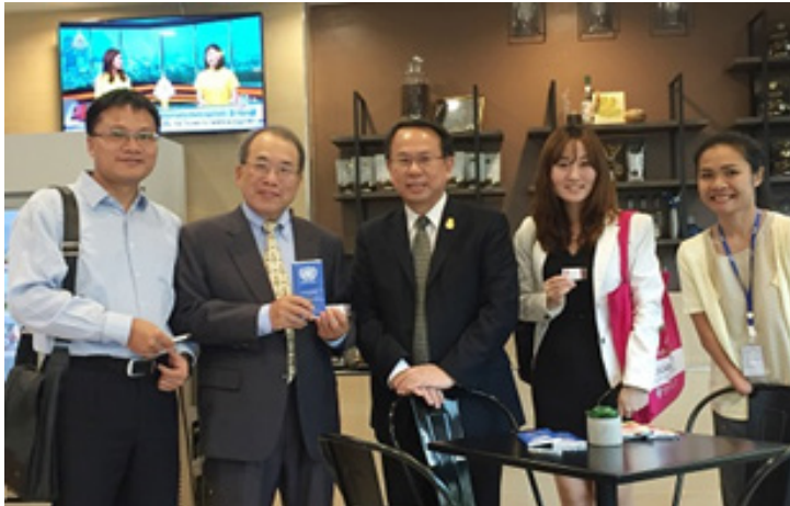
Visit from officials of Taipei Economic & Cultural Office (TECO) on 5 July 2019 in Bangkok, Thailand