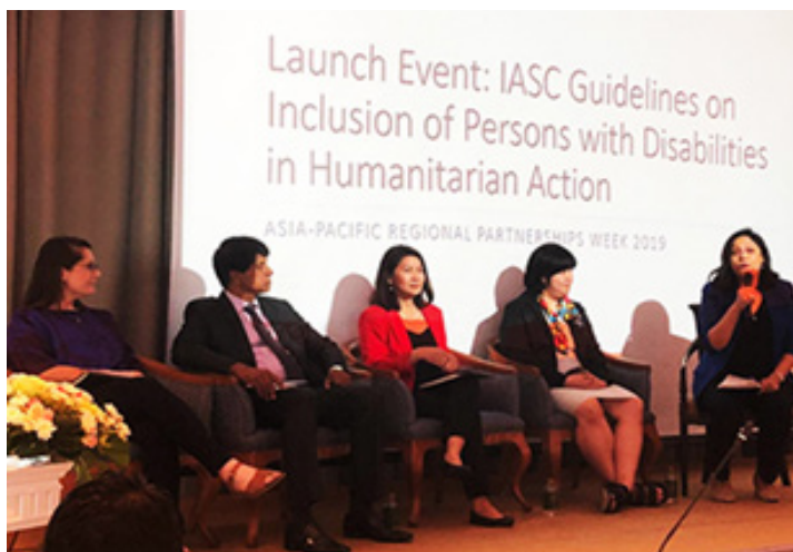
APCD joined Launch Event on 'Inter-Agency Standing Committee (IASC) Guidelines on Inclusion of Persons with Disabilities in Humanitarian Action', 28 November 2019, Bangkok, Thailand