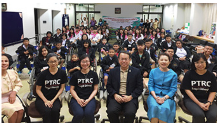
Study visit of WAFCAT and Students from Rangsit University at APCD, 9 October 2019, Bangkok, Thailand