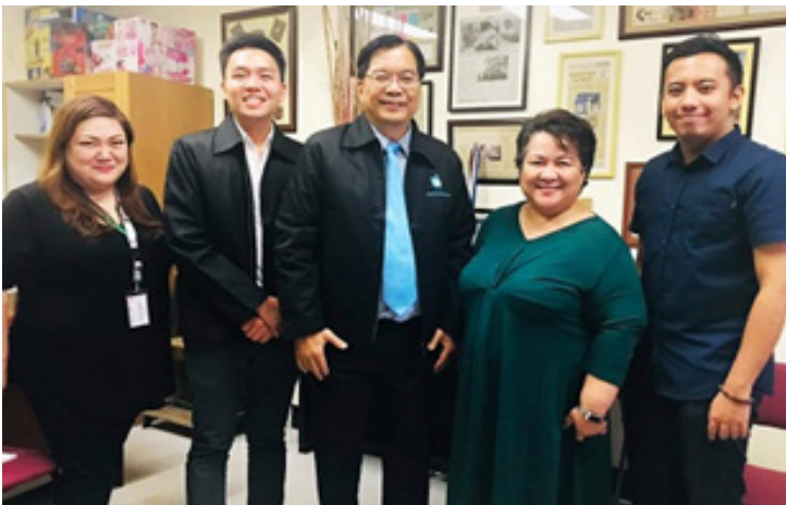
Follow-Up Meeting and Courtesy Visits to ASEAN Autism Mapping Project Partners and Stakeholders, 29 January –1 February 2019, Quezon City, Philippines