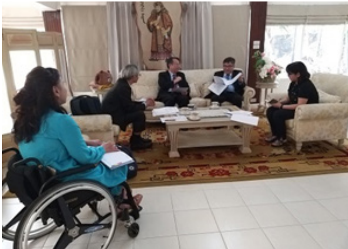
Courtesy Call of APCD to the Ambassador of Mongolia, 30 January 2019, Bangkok, Thailand