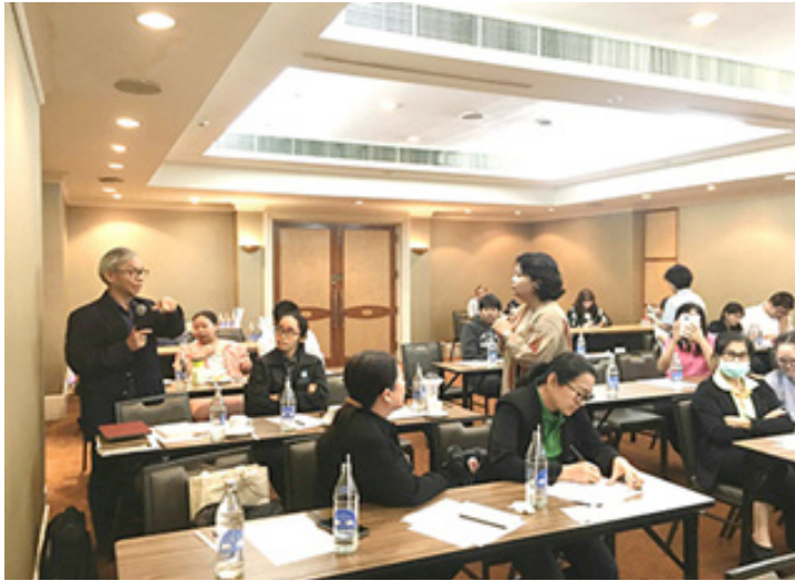
APCD attended a Workshop on “Promoting the Sexual and Reproductive Rights, and Rights Knowledge to Youths with Disabilities”, 25 December 2019, Bangkok, Thailand