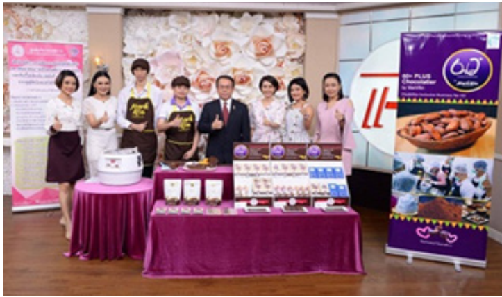
APCD's 60+ Plus Chocolate Products and Café Featured on Thai TV Channel 3, 13 February 2019 Bangkok, Thailand