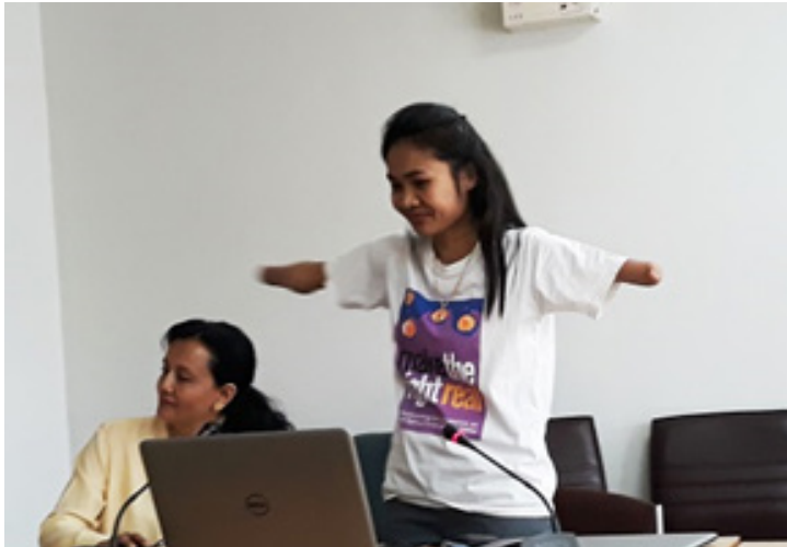
APCD Internal Capacity Development Training on International Instruments ( UNCRPD, SDGs, Incheon Strategy, and ASEAN Enabling Master plan) 25 January 2019, Bangkok, Thailand