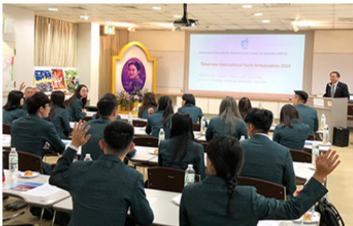
Taiwanese University Students Exchange Program at APCD, 26 August 2019, Bangkok, Thailand