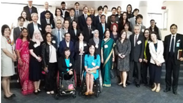
Fifth Session of the Working Group on the Asian and Pacific Decade of Persons with Disabilities 2013-2022, 21 February 2019, Bangkok, Thailand