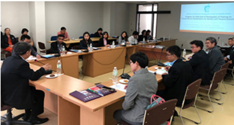
ASEAN Delegates from Training on “Comprehensive Rehabilitation for Workers with Physical Disabilities” at APCD, 29 August 2019, Bangkok, Thailand