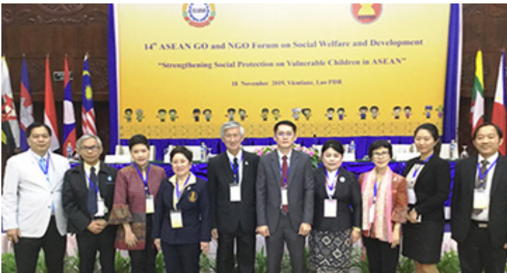
APCD Mission to Lao PDR for Strengthening Collaboration among Stakeholders in ASEAN Region, 17-20 November 2019, Vientiane, Lao PDR