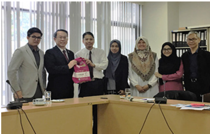
Study Visit of Researchers from the International Islamic University of Malaysia on Employability for Persons with Disabilities to APCD, 10 October 2019, Bangkok, Thailand