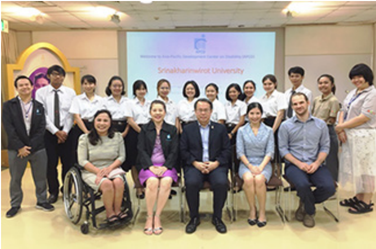
Study Visit of Students and Lecturers from the Faculty of Education, Srinakharinwirot University and University of Vienna at APCD, 19 November 2019, Bangkok, Thailand