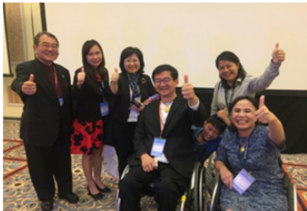
APCD Participated in Rehabilitation International (RI) Asia and Pacific Regional Conference, 25-29 June 2019, Macau