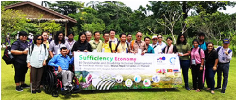
Annual International Training Course (AITC) on Sufficiency Economy to Sustainable and Disability Inclusive Development, 15-28 September 2019, APCD Training Center, Bangkok, Nakhon Pathom, and Buri Ram Province, Thailand

Thailand International Cooperation Agency (TICA), the Ministry of Foreign Affairs in collaboration with the Asia-Pacific Development Center on Disability (APCD) organized the Annual International Training Course (AITC) for potential community leaders with/without disabilities and government representative from the South Asian countries (Bhutan, Nepal, Sri Lanka) and Thailand on Sufficiency Economy to Sustainable and Disability Inclusive Development from 15-28 September 2019. The training aims at strengthening regional collaboration and networks among countries and also to involve and build the capacity through exchanging knowledge and information in successfully implementing activities towards sustainability in perspective of SEP.