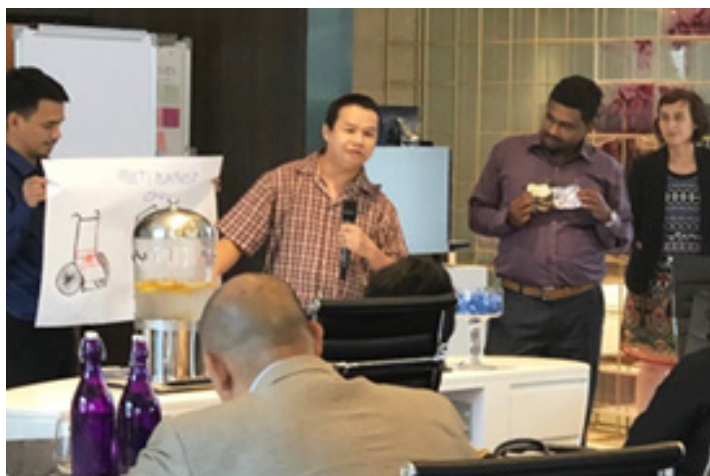
APCD Joined Singapore Cooperation Programme's 'Course on Empowering Persons with Disabilities and Special Needs', 27-31 May 2019, Singapore