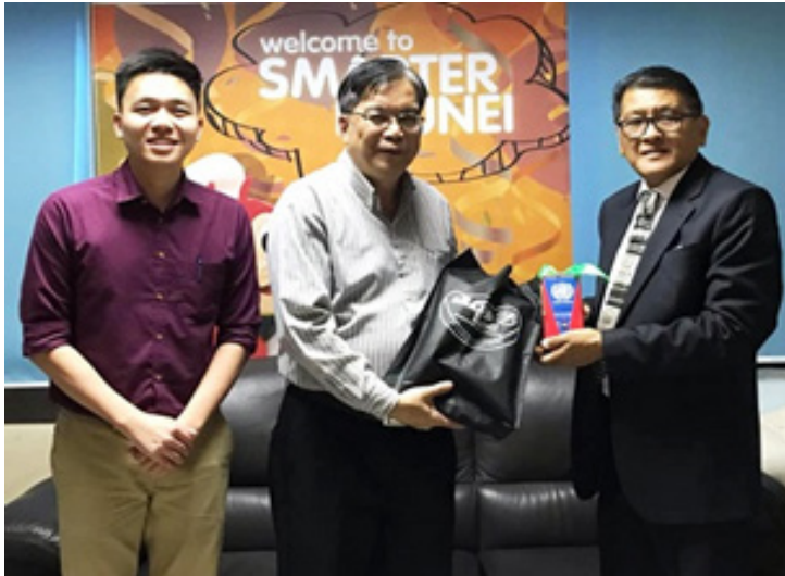
Follow-Up Meetings with ASEAN Autism Mapping Project Partners and Stakeholders, 14-16 January 2019, Bandar Seri Begawan, Brunei