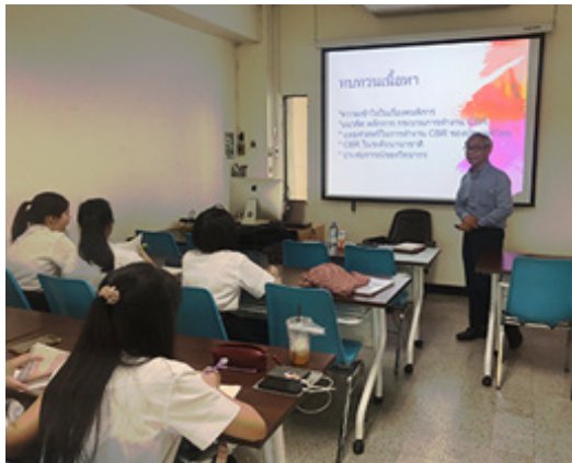
APCD was invited to conduct a session on ‘Stakeholders Collaboration to Promote Community-Based Inclusive Development’ at Srinakharinwirot University, 29 October 2019, Bangkok Thailand