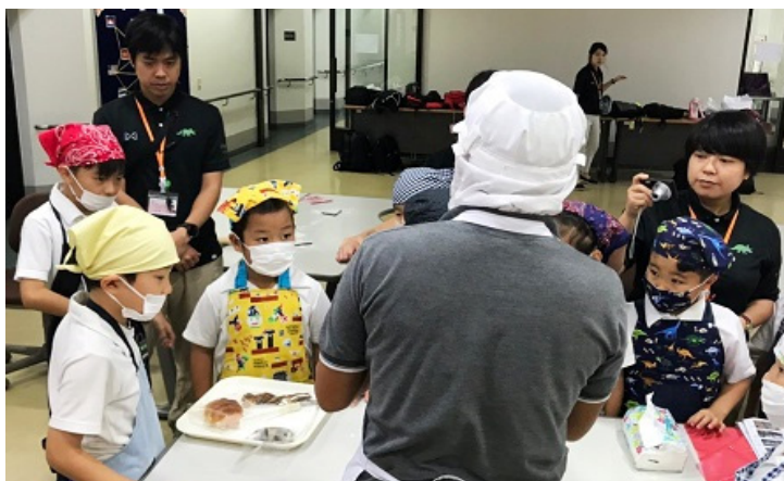
Thai-Japan Association School Study visit and Workshop on Bakery at APCD, 12 February 2019 Bangkok, Thailand